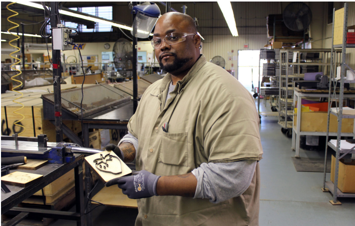
An inmate fabricates paper and cloth-cutting dies in Nebraska for use in crafts, quilting, and education.