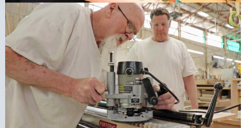
Top: An inmate team performing website accessibility analysis in Oregon. Bottom: An inmate in Utah works a router in a furniture shop.