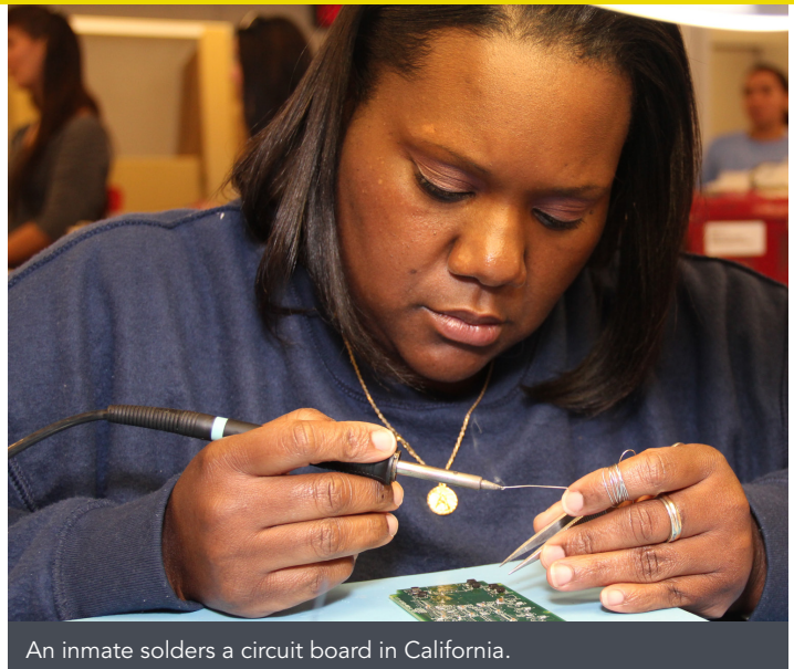
An inmate solders a circuit board in California.

Up to 50 jurisdictions around the country may be certified under PIECP. Certification in the program exempts the corrections agency from normal restrictions on the sale of inmate-made goods in interstate commerce, which is prohibited by 18 U.S.C. 1761(a). As of July 2018,