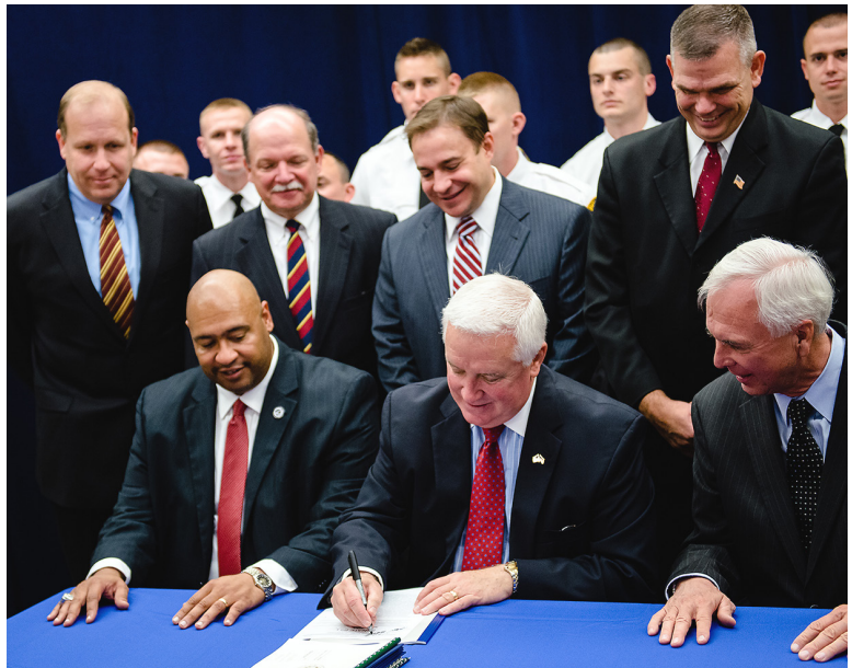
Pennsylvania Governor Tom Corbett signs the state's justice reinvestment legislation into law in 2012.

For example, in 2012 Pennsylvania policymakers established a performance-incentive funding system to divert offenders who received short sentences for misdemeanors and felonies from being sentenced to prison. The state has committed to providing new funding to those counties that in turn voluntarily expand their local capacity to reduce the risk of recidivism among these offenders.