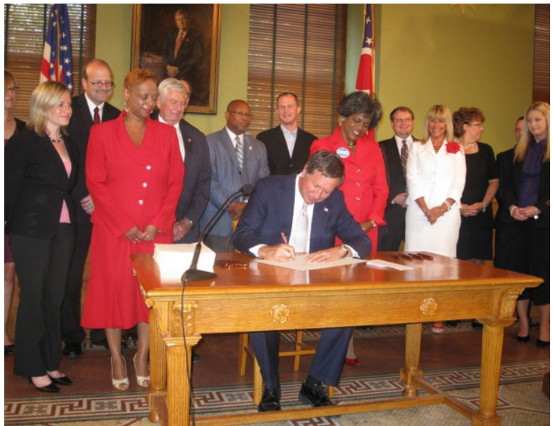
Ohio Governor John Kasich signs the state's justice reinvestment legislation into law in 2011.

For example, in Ohio there are more than 250,000 people on probation supervision who are supervised by one or more of the 187 different probation agencies in the state. Without any statewide probation standards, policies and practices varied substantially. Many departments did not use evidence-based practices such as risk assessment and no data were collected statewide about who was on probation or how well they did. In 2011, the state adopted a series of policies to strengthen probation supervision by establishing the first set of statewide standards for probation agencies, and an incentive grant program to spur performance among probation departments to bolster training and improve supervision outcomes.