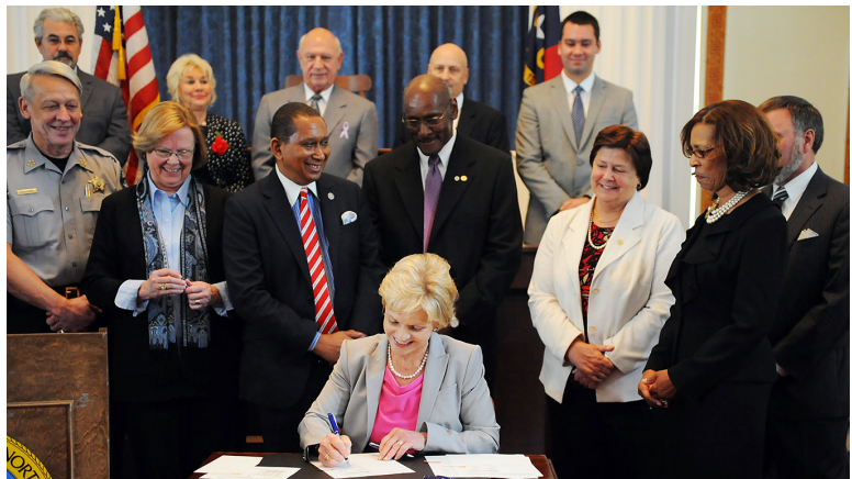
Then North Carolina Governor Beverly Perdue signs the Justice Reinvestment Act into law in 2011.

Victim advocates in Hawaii, for example, were quick to point out the deficiency in how victim restitution was collected in the state-run facilities. Because restitution is intended to assist in repaying victims for expenses related to the crime they suffered and to hold individuals accountable for their actions, the insight of victim advocates helped to focus policymakers' efforts. As a result, Hawaii is recasting its restitution collection infrastructure to improve the collection practices in state facilities and increase the percentage of monies repaid to victims.