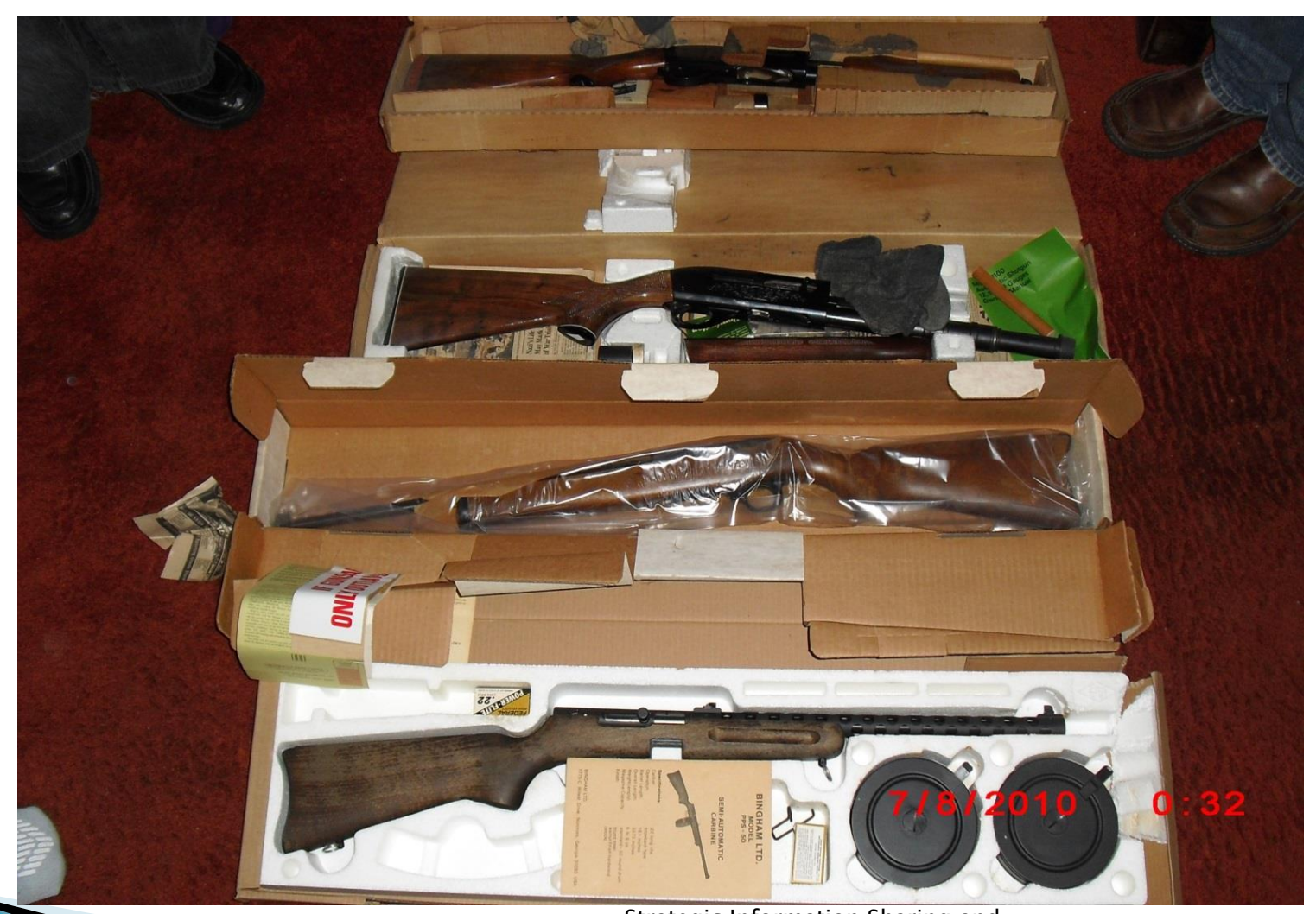
Strategic Information Sharing and Safeguarding Between Risk Management Professionals and Disciplines ATAP 2014