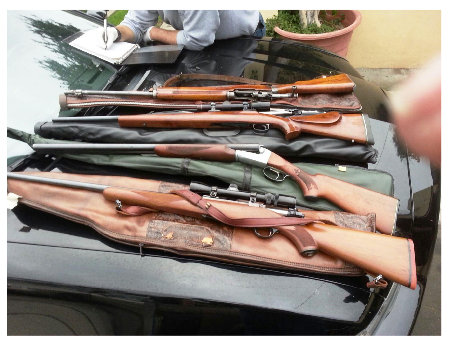
Strategic Information Sharing and Safeguarding Between Risk Management Professionals and Disciplines ATAP 2014