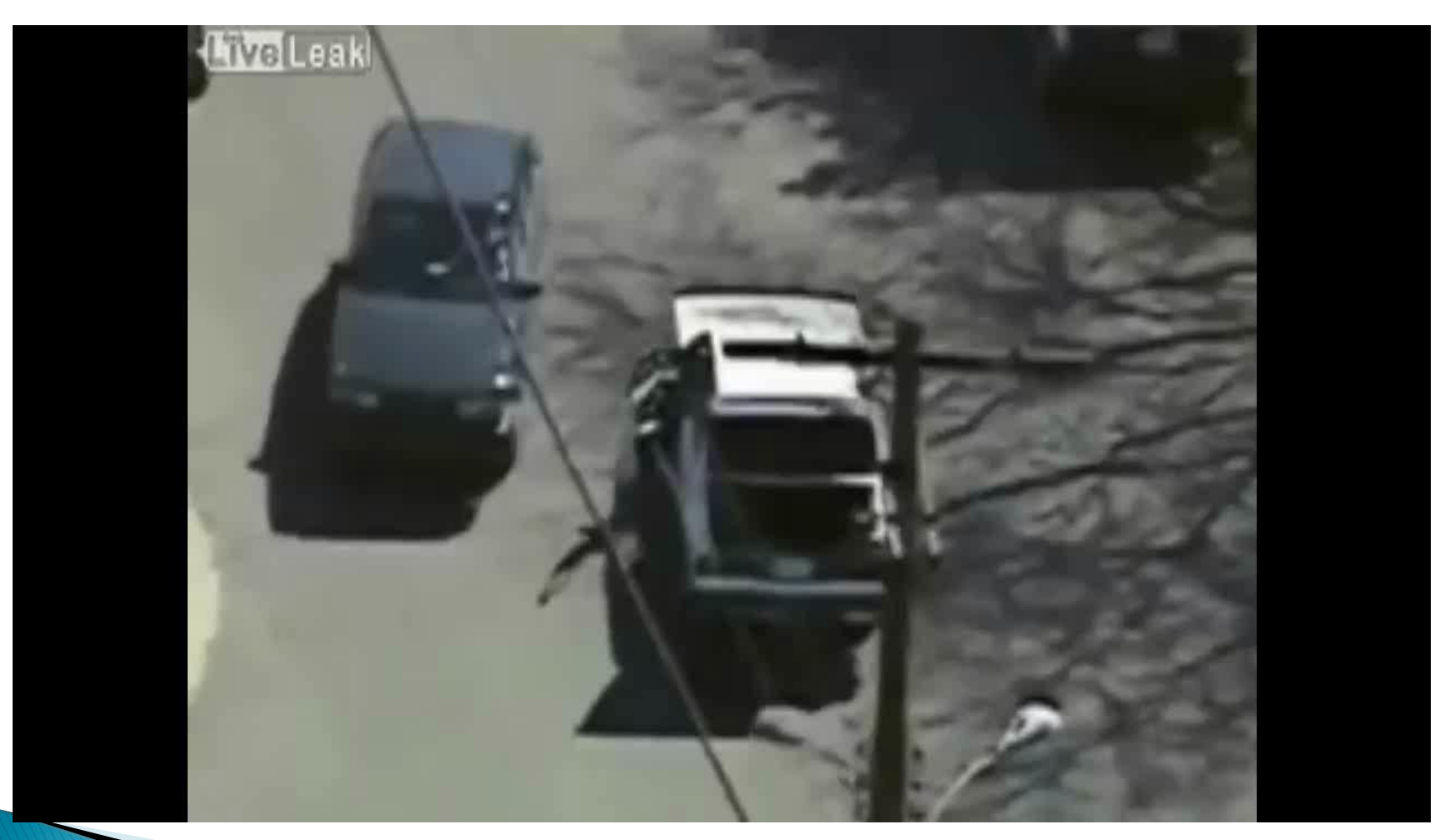
Strategic Information Sharing and Safeguarding Between Risk Management Professionals and Disciplines ATAP 2014