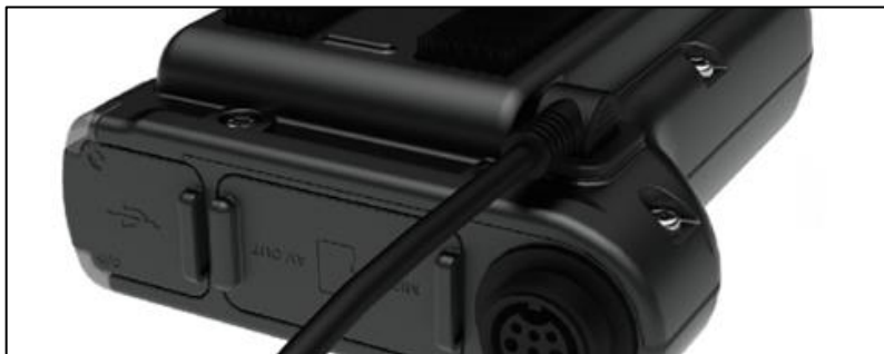
Figure 64. Zepcam TI XT