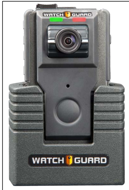
Figure 60. WatchGuard Vista WiFi