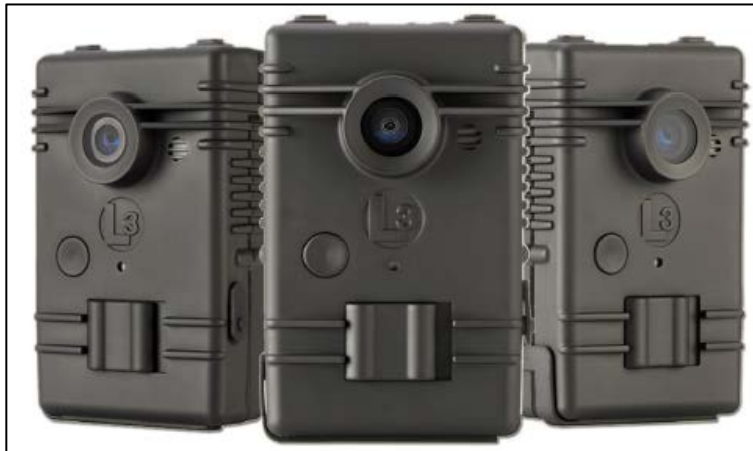
Figure 22. L-3 Mobile-Vision BodyVision XV