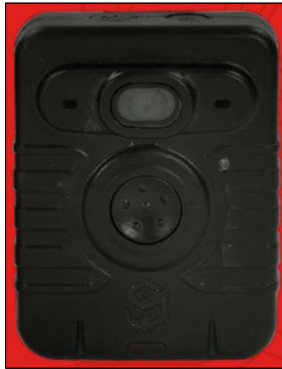
Figure 47. Safety Innovations VidCam VX