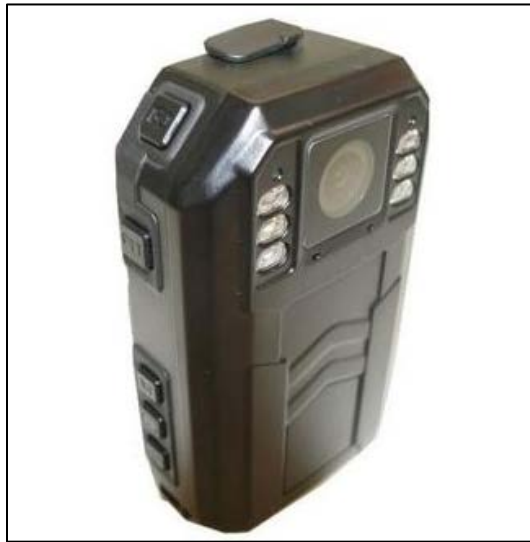
Figure 52. Titan BWC-3HV2