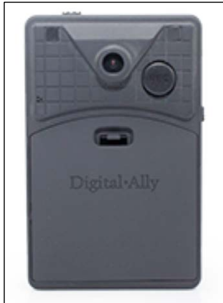
Figure 12. Digital Ally FirstVu HD One Body Worn Camera