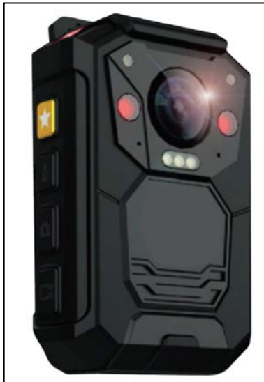
Figure 18. HauteSpot HauteVIEW 100