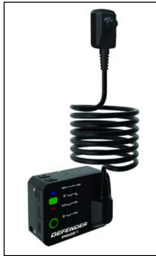
Figure 38. PRG 51 Defender Body Worn Camera