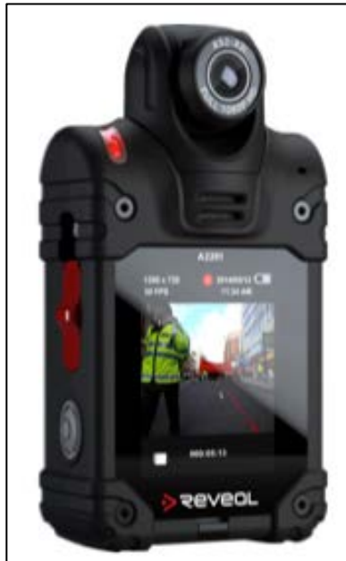
Figure 46. Reveal Media RS2-X2L