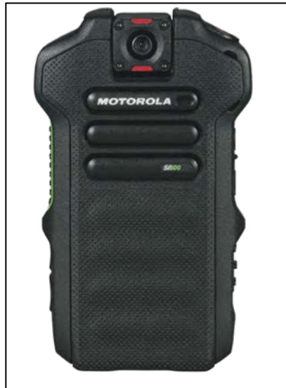
Figure 28. Motorola Si500 Video Speaker Microphone