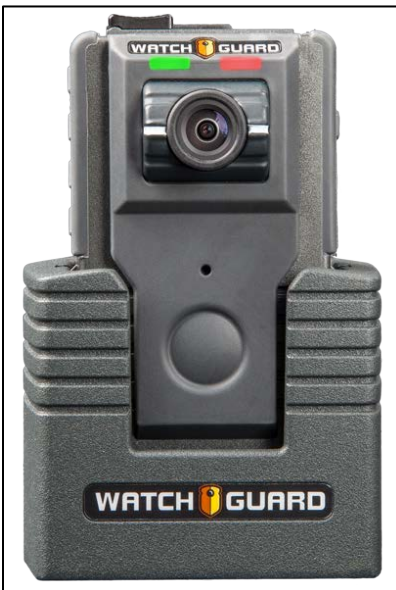
Figure 58. WatchGuard Vista Extended Capacity