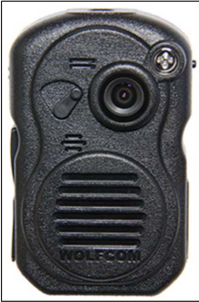
Figure 61. WOLFCOM 3 rd Eye