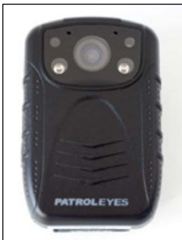
Figure 30. Patrol Eyes SC-DV1