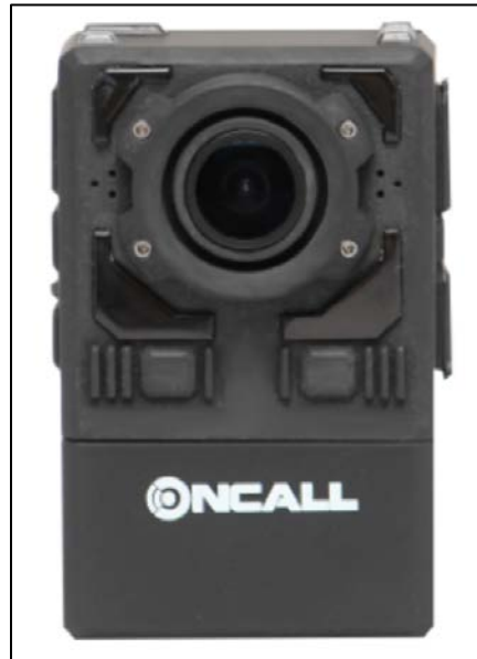
Figure 34. Paul Conway OnCall Camera