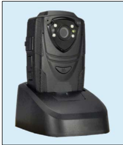
Figure 20. HD Protech CITE M1G2