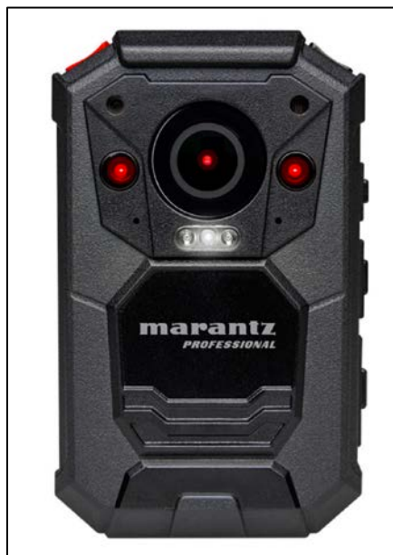
Figure 24. Marantz Professional PMD-901V