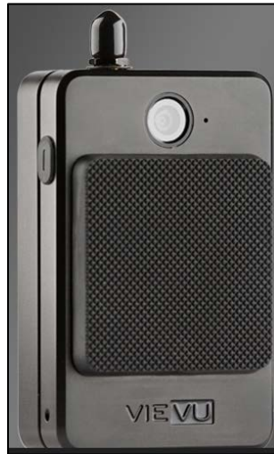
Figure 54. VieVu LE4