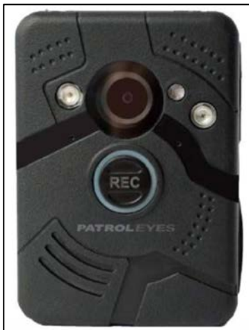
Figure 32. Patrol Eyes SC-DV6