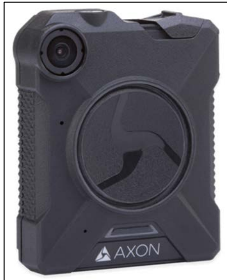
Figure 50. TASER Axon Body 2