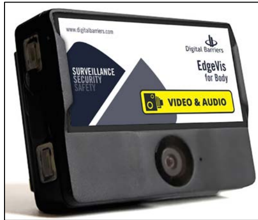
Figure 6. Brimtek EdgeVis VB320W