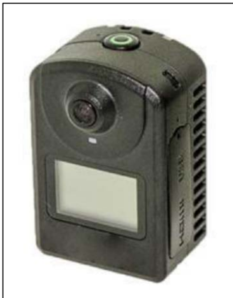
Figure 4. BrickHouse Security Ultra Compact HD WiFi Camera