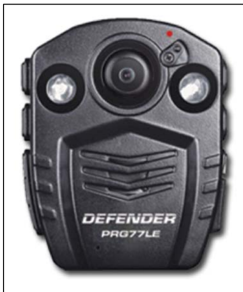
Figure 40. PRG 77LE Defender Body Worn Camera