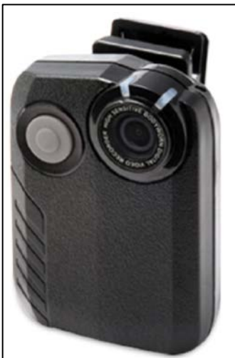
Figure 9. Data911 Verus BX1 Body Camera