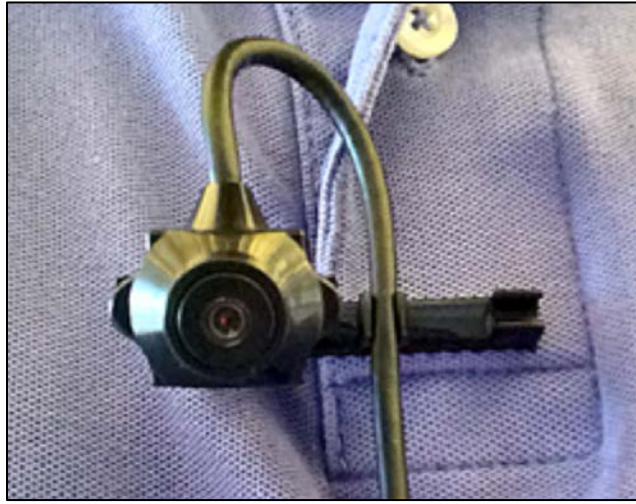
Figure 13. FlyWire Body Worn Security Cam Kit