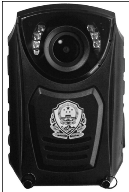
Figure 57. VP360 Argus Gen 2 Digital BWC