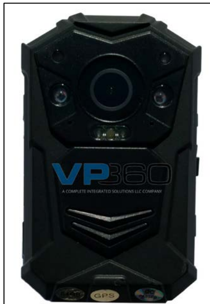
Figure 56. VP360 Argus Gen 1 Digital BWC