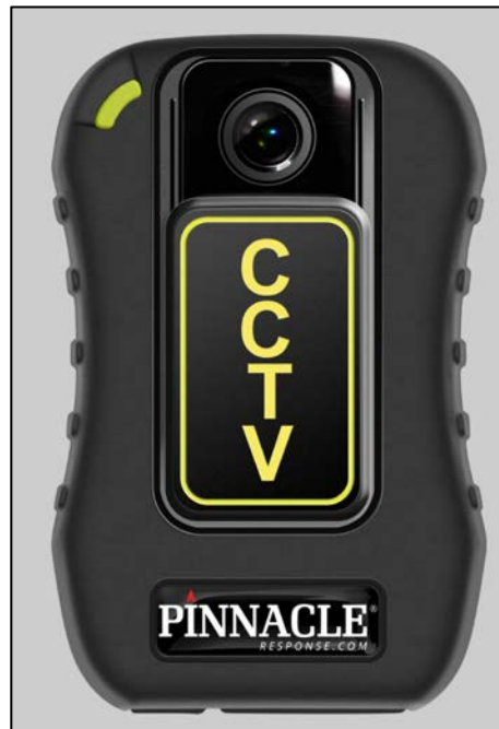
Figure 35. Pinnacle PR5 BWV Camera