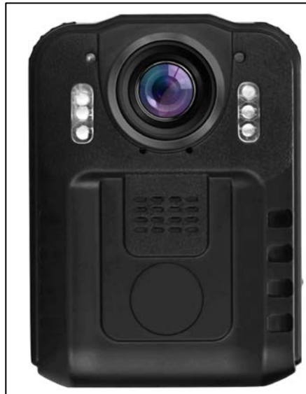
Figure 44. Primal USA DutyVUE PrimeOBSERVER 2020