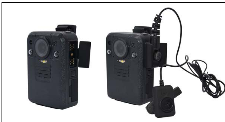
Figure 42. Primal USA DutyVUE PrimeOBSERVER I