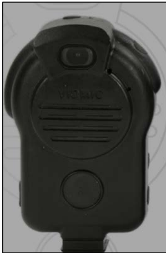
Figure 48. Safety Innovations VidMic VX