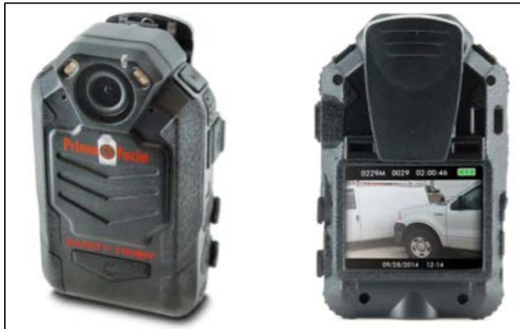
Figure 49. Safety Vision Prima Facie