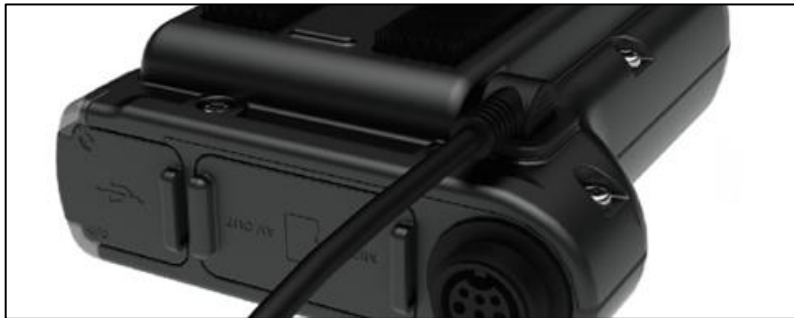
Figure 65. Zepcam TI XT Live