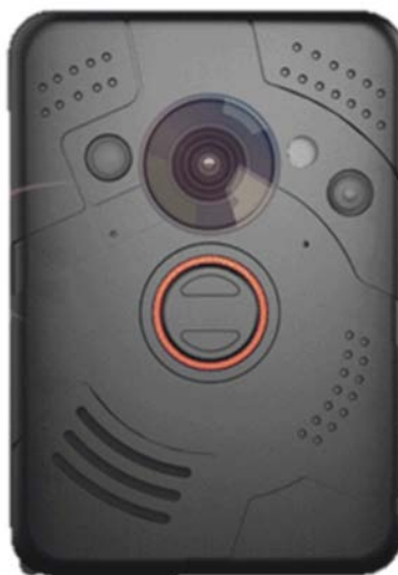
Figure 2. Black Mamba BMPpro Elite