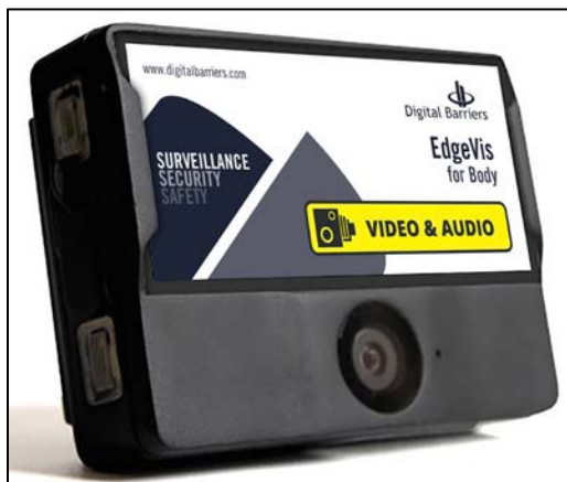
Figure 7. Brimtek EdgeVis VB340W