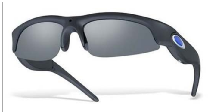
Figure 41. Primal USA DutyEGS Evidence Gathering Sunglasses