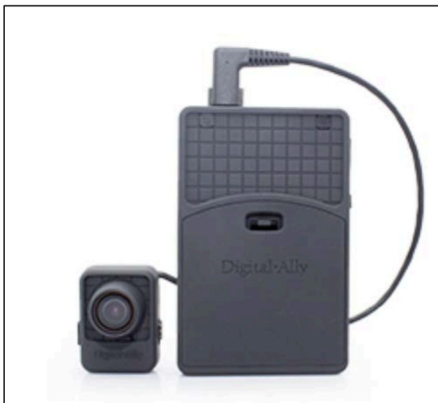
Figure 11. Digital Ally FirstVu HD Body Worn Camera