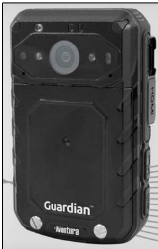
Figure 1. Aventura GPC-RA Body Worn Camera