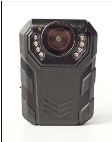
Figure 33. Patrol Eyes SC-DV7