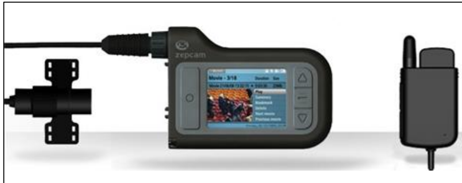
Figure 63. Zepcam TI