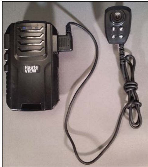
Figure 19. HauteSpot HauteVIEW 200