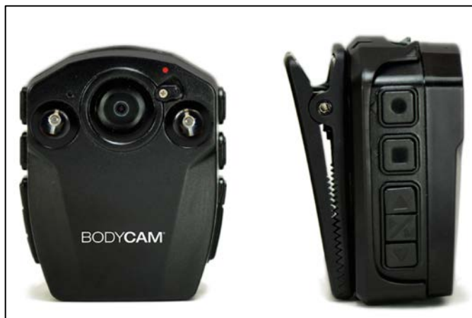
Figure 45. PRO-VISION BodyCam