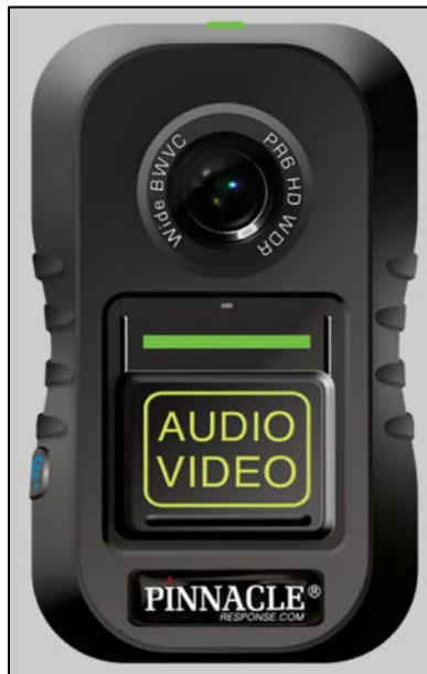
Figure 36. Pinnacle PR6 BWV Camera