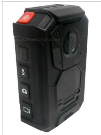
Figure 25. Martel Frontline Cam