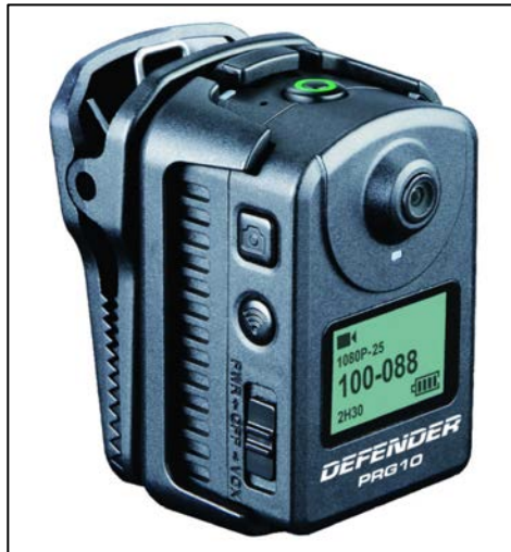
Figure 37. PRG 10 Defender Body Worn Camera