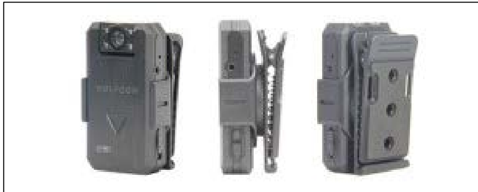
Figure 62. WOLFCOM Vision