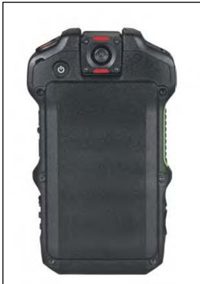
Figure 27. Motorola Si300 Video Speaker Microphone