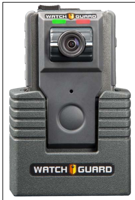
Figure 59. WatchGuard Vista Standard Capacity