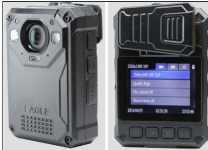
Figure 15. Global Justice Eagle NextGen