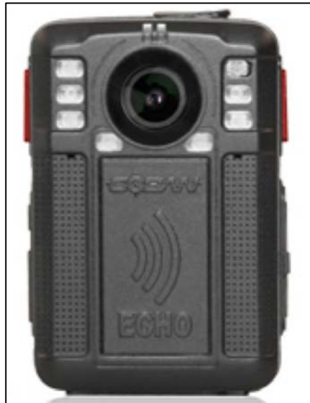
Figure 8. COBAN Body Camera