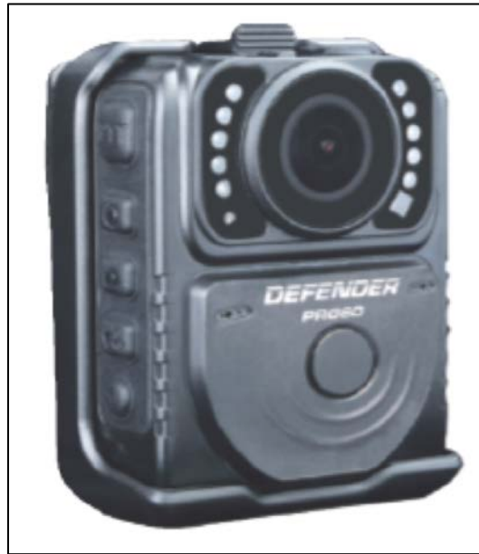
Figure 39. PRG 60B Defender Body Worn Camera