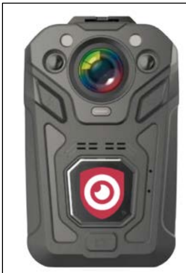
Figure 43. Primal USA DutyVUE PrimeOBSERVER II