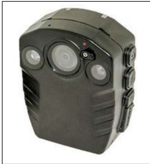
Figure 3. BrickHouse Security HD Waterproof Police Camera