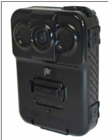
Figure 21. Kustom Signals Eyewitness Vantage