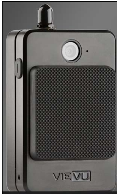
Figure 55. VieVu LE4 Mini