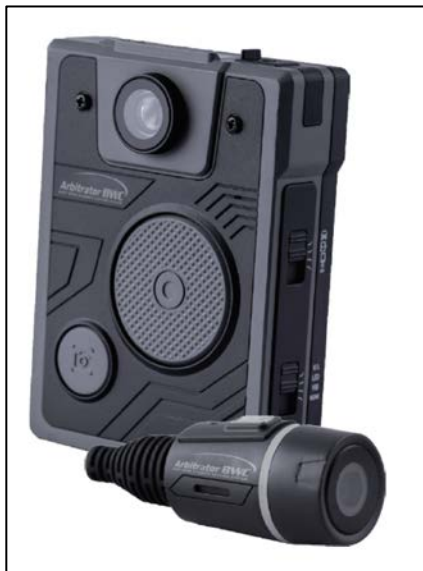
Figure 29. Panasonic Arbitrator