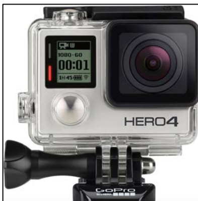
Figure 16. GoPro Hero4 Silver