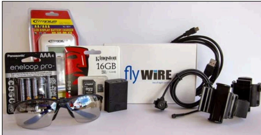
Figure 14. FlyWire Glasses Worn Security Cam Kit