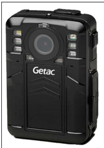
Figure 10. DEI Getac Veretos Body Worn Camera