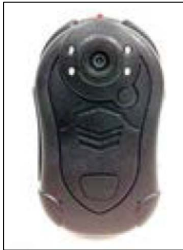
Figure 26. Martel Vid-Shield