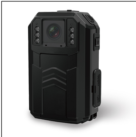
Figure 66. Zetronix HD Blue Line Police Body Camera