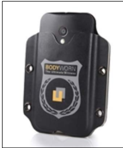
Figure 53. Utility BodyWorn