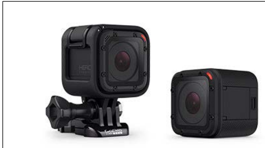
Figure 17. GoPro Hero4 Session