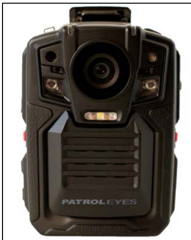
Figure 31. Patrol Eyes SC-DV5