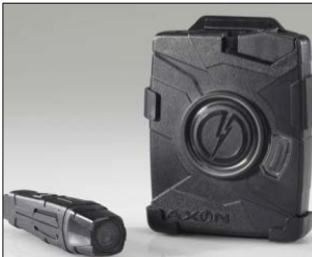
Figure 51. TASER Axon Flex