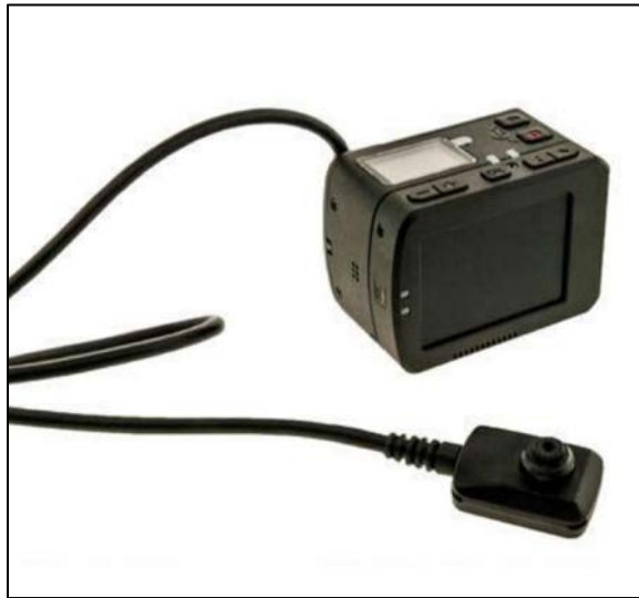
Figure 5. BrickHouse Security HD WiFi Police Button Camera